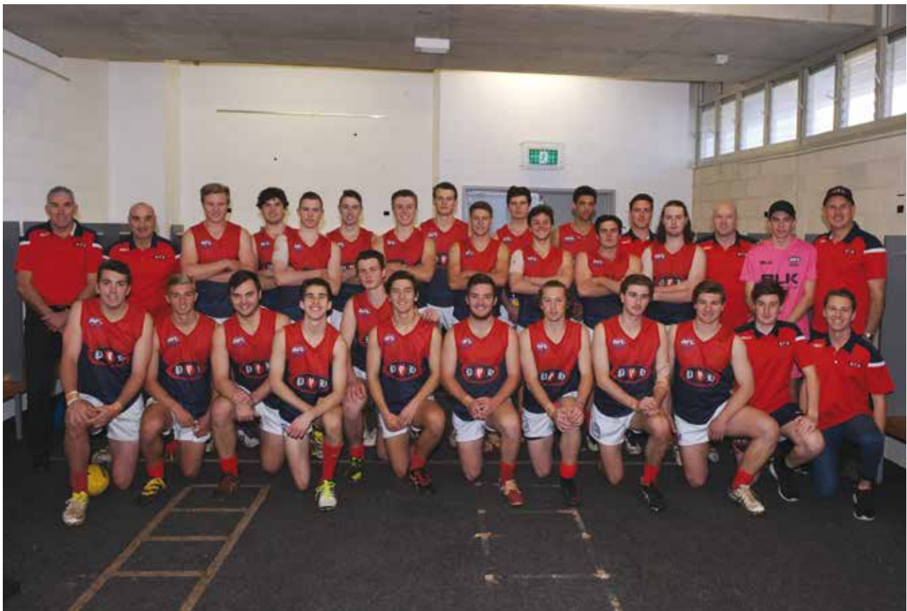
Under 19 Division One