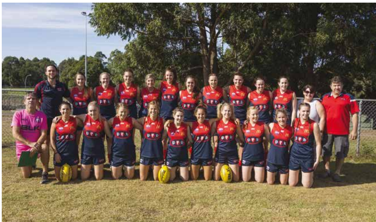
Women's Division One