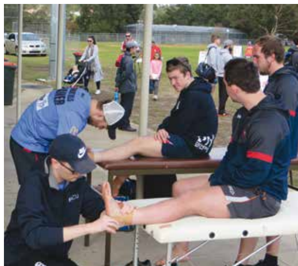
Physios at Work