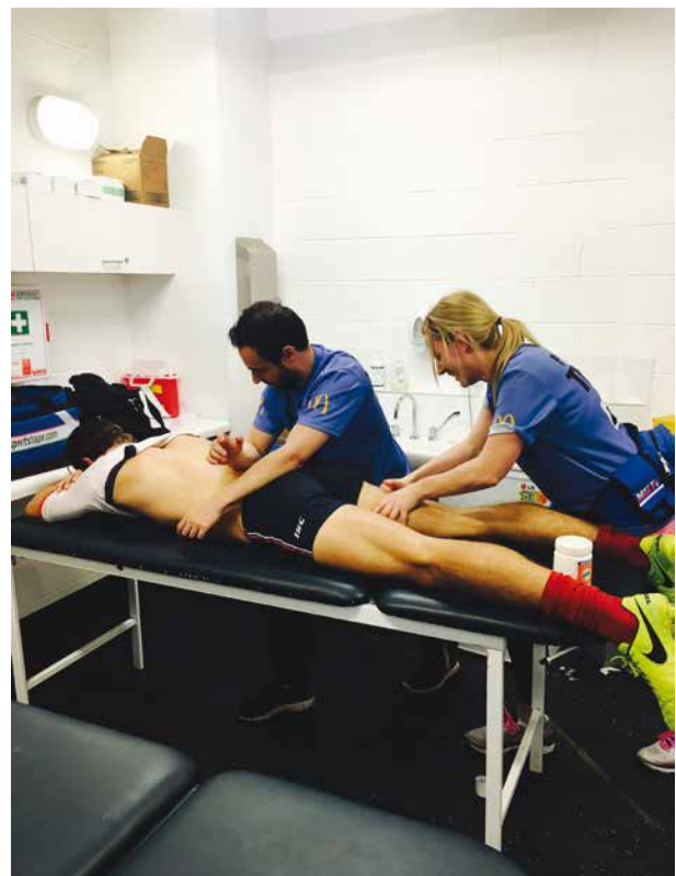
Physios at Work