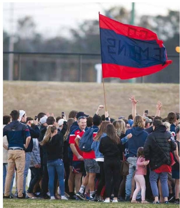
Grand Final crowd