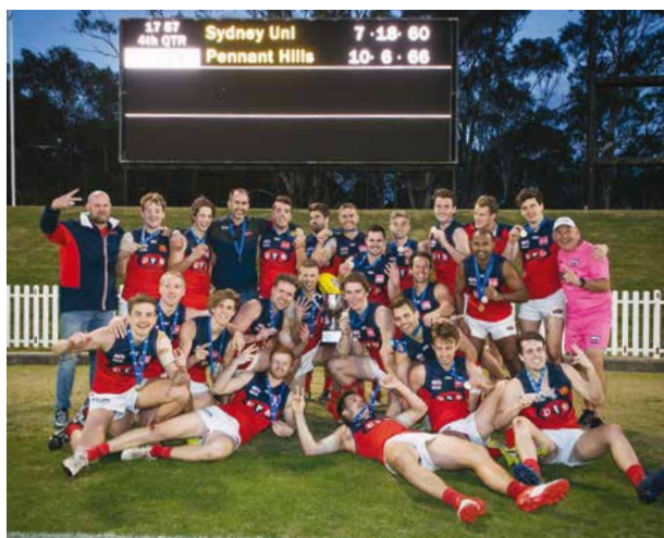
Grand Final scoreboard