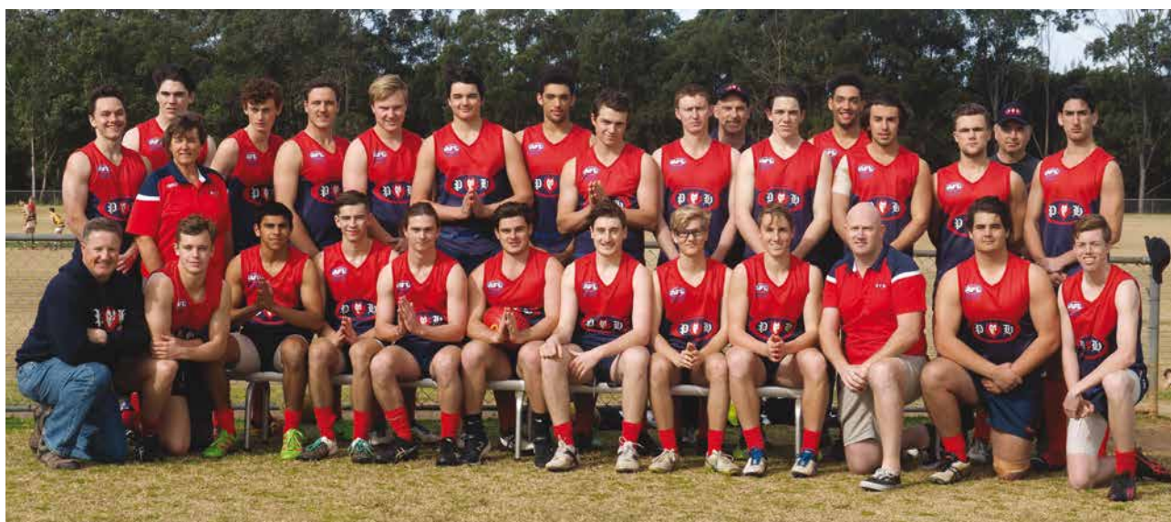
Under 19 Division One