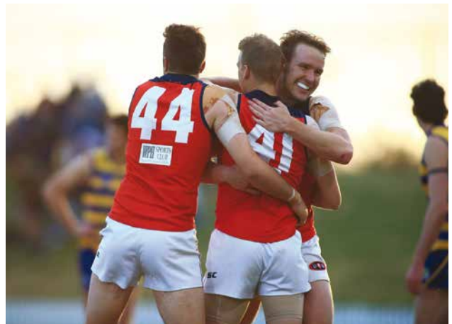
King and that moment!!!