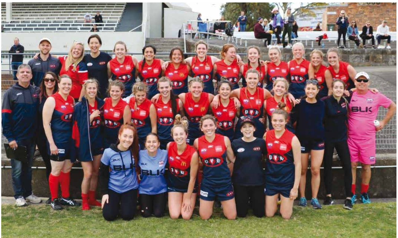
Women's Division One