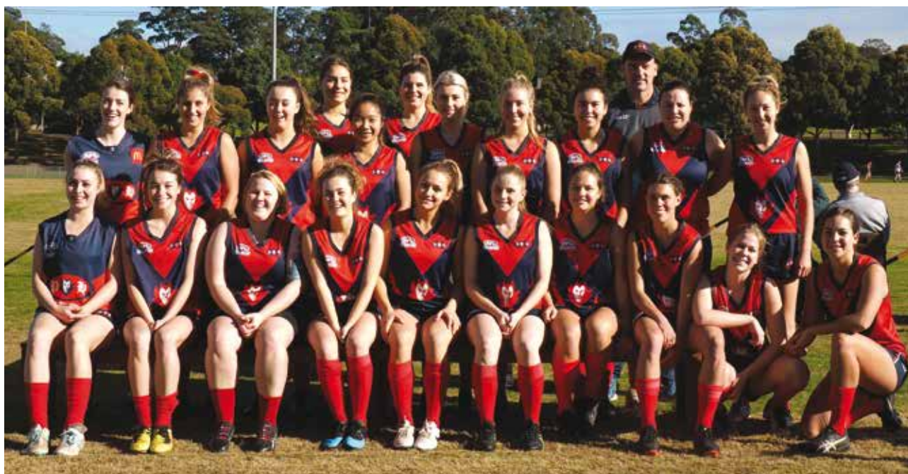
Women's Division Three