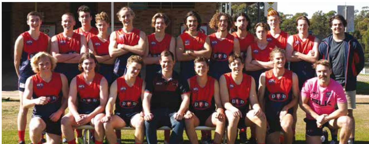
Under 19 Division One