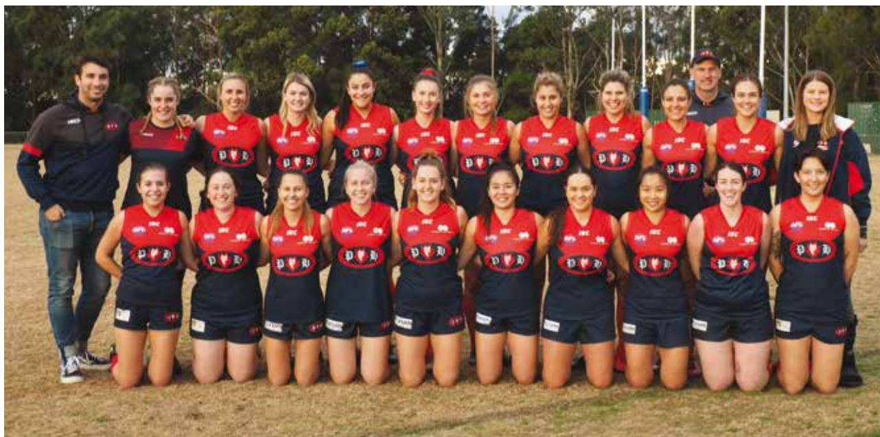
Women's Division Two