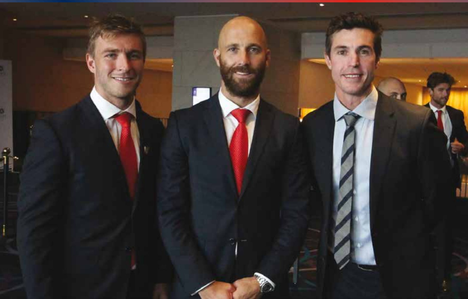
Pennant Hills players Kieran Jack, Jarrod McVeigh and Lenny Hayes – Inducted into the NSW AFL Team of Century