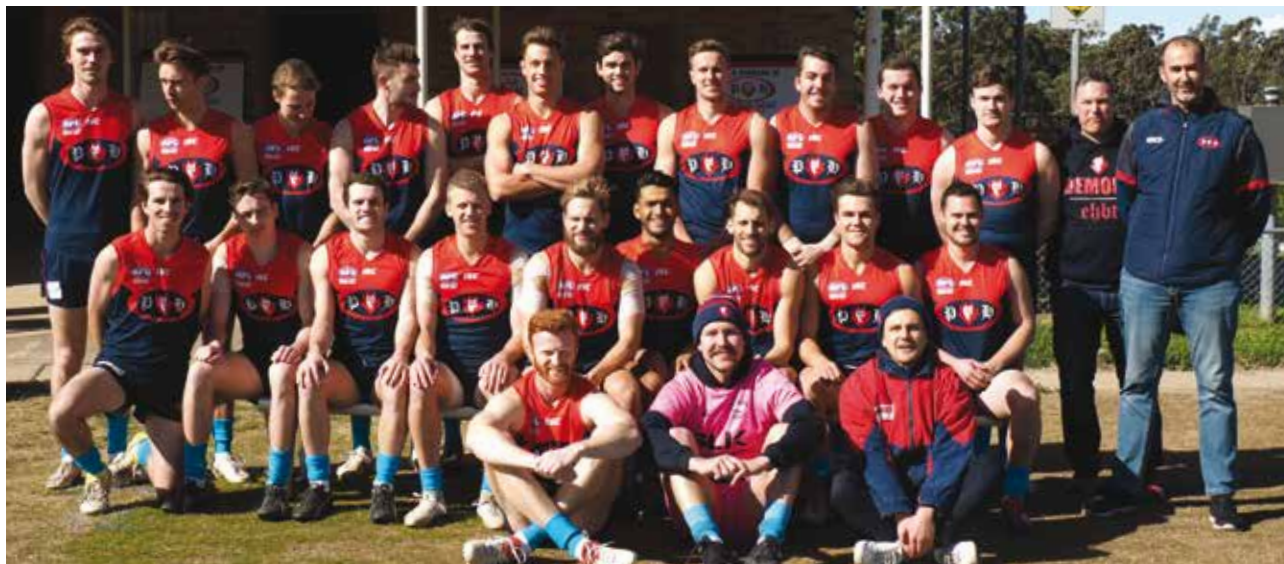
Premier Division Seniors