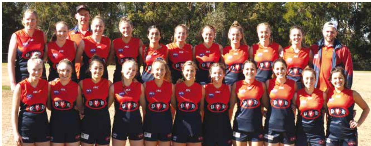
Women's Division One