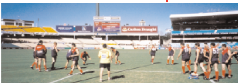
Seniors WarmUp at the SCG - Aug 19