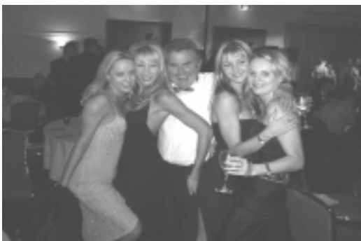
The Dance of the 'Mighty Moose'!