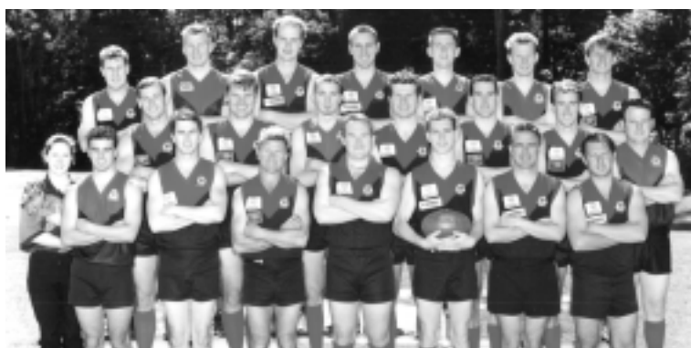
Third Grade 2001