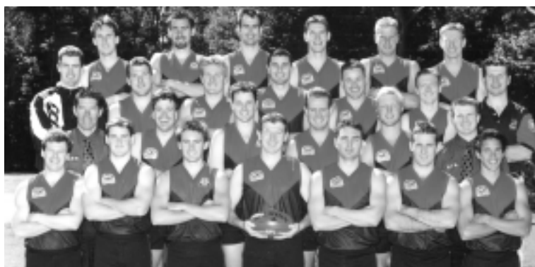
Senior Grade 2001