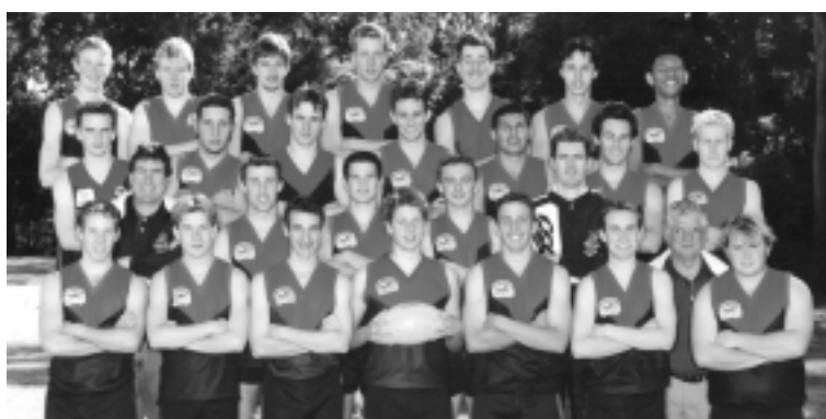
Under 18 Grade 2001