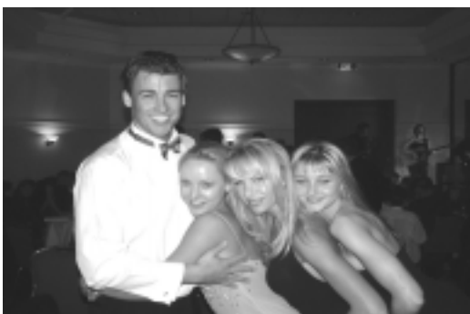
Not happy with one date, Robbo bought three!