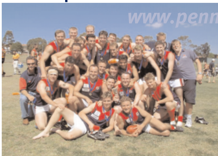
Telf's 'Thirsty Thirds' win the 2001 flag