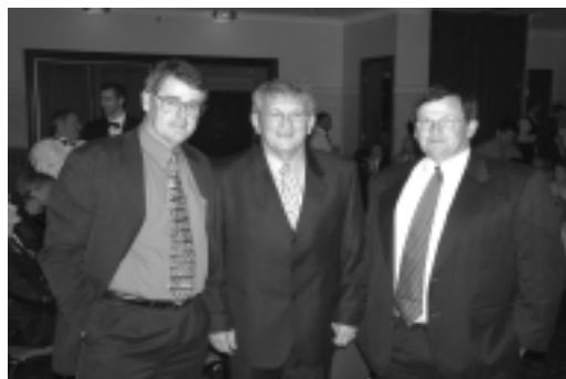
The three amigos! - Penno Powerbrokers?