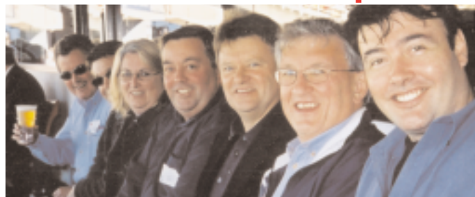
Entertaining the Sponsors at the SCG - Aug 19