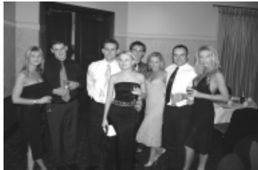
Robbo looked away and the boys swooped...