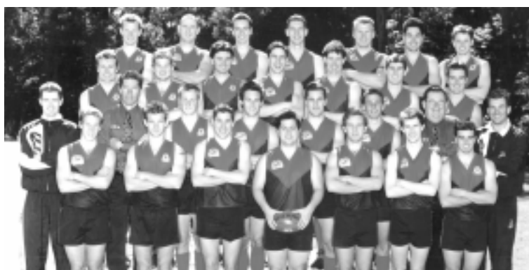
Reserve Grade 2001