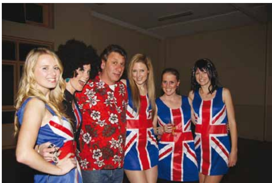
2010 Demons Disco night