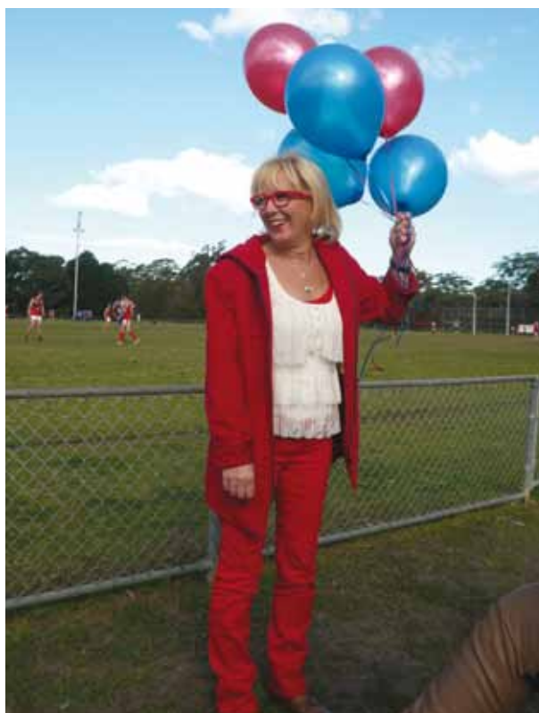
No 1 Barracker