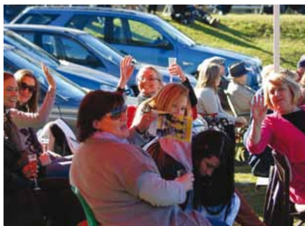
2000 Ladies Day at The Ern