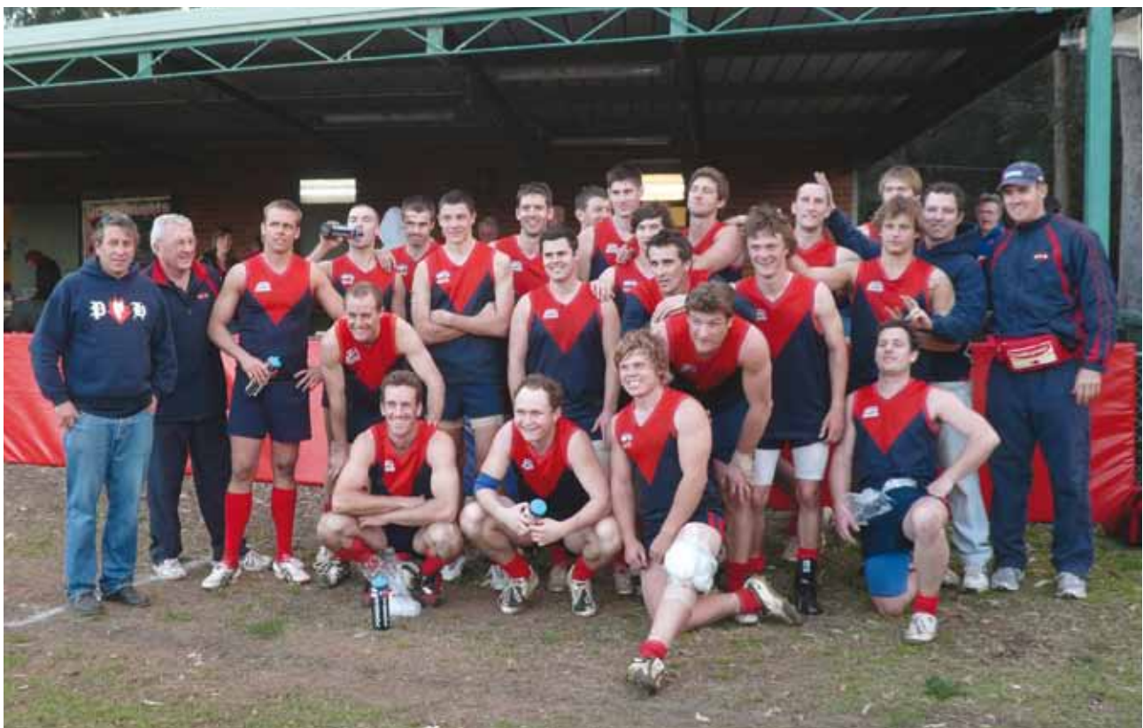
2010 Last Game at The Ern