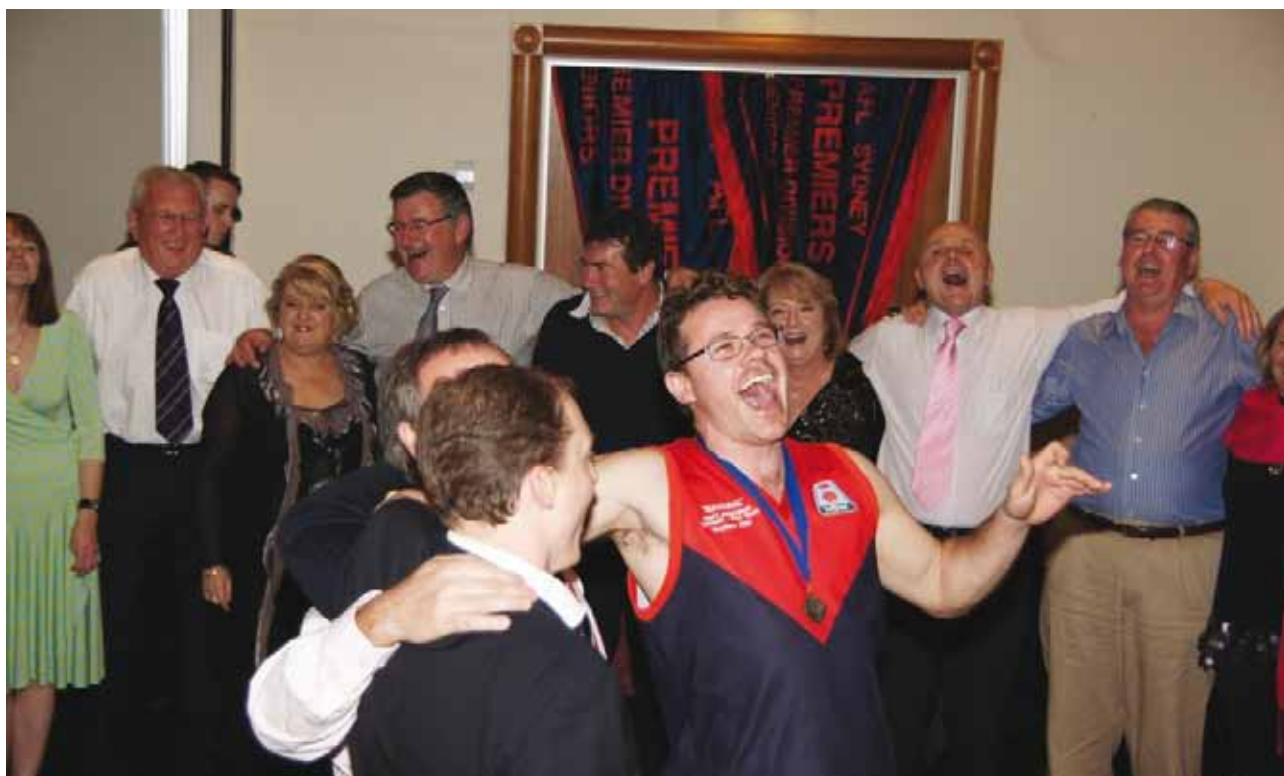
2000 Premiership 10 yr Reunion