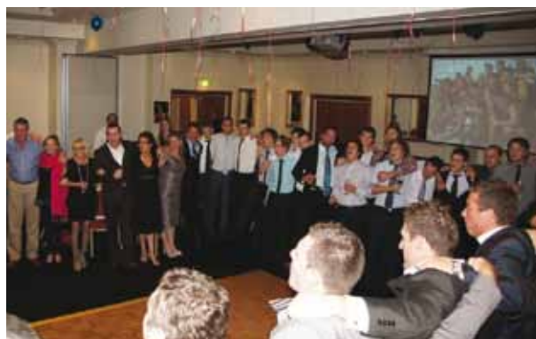
2000 Premiership 10 yr Reunion