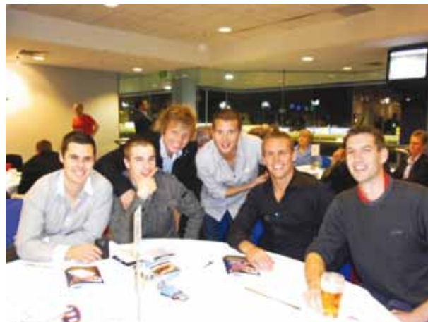
Harold Park Function