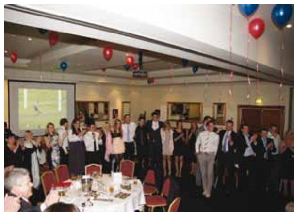
2000 Premiership 10 yr Reunion