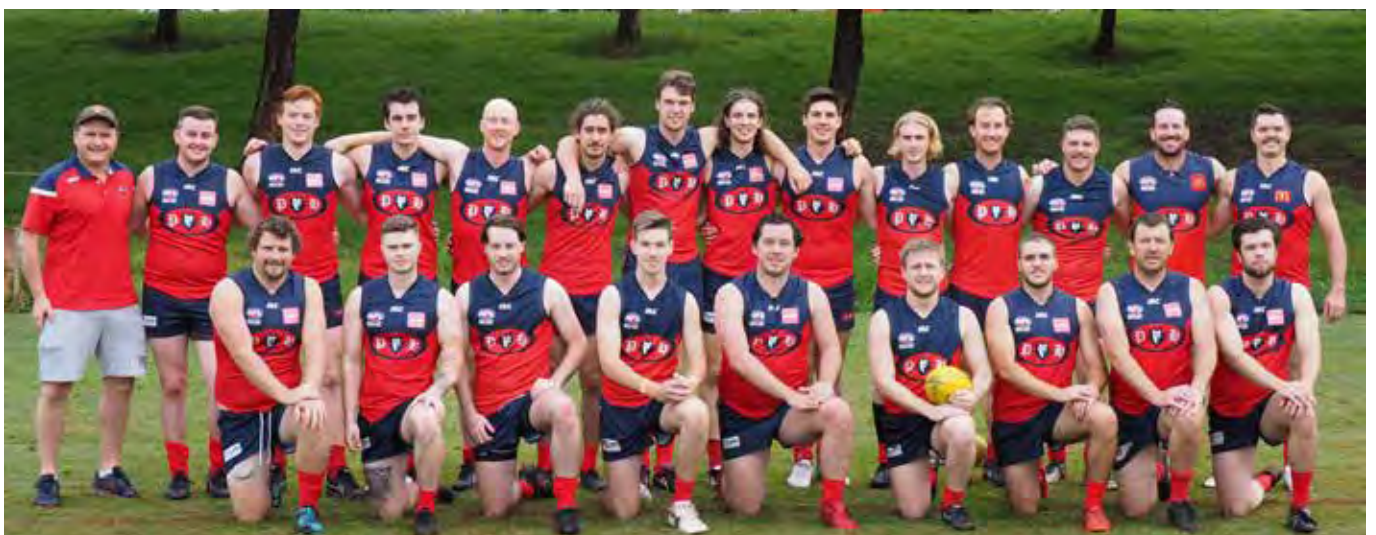
Mens Div One 2022