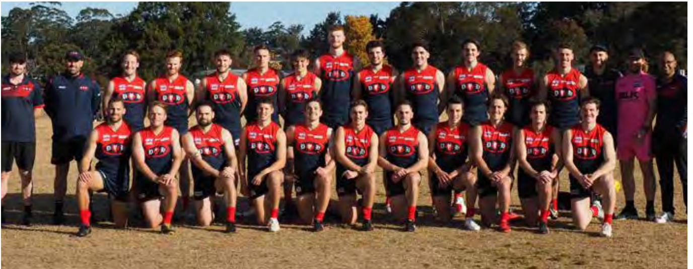
Mens Premier Seniors 2022