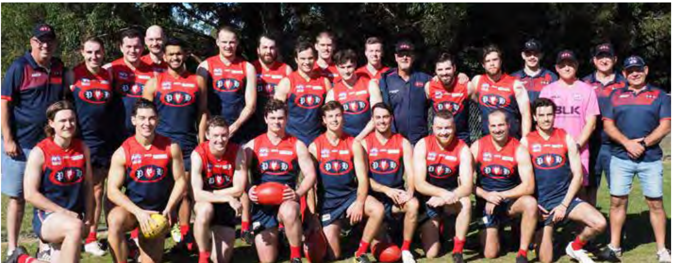
Mens Premier Reserves 2022