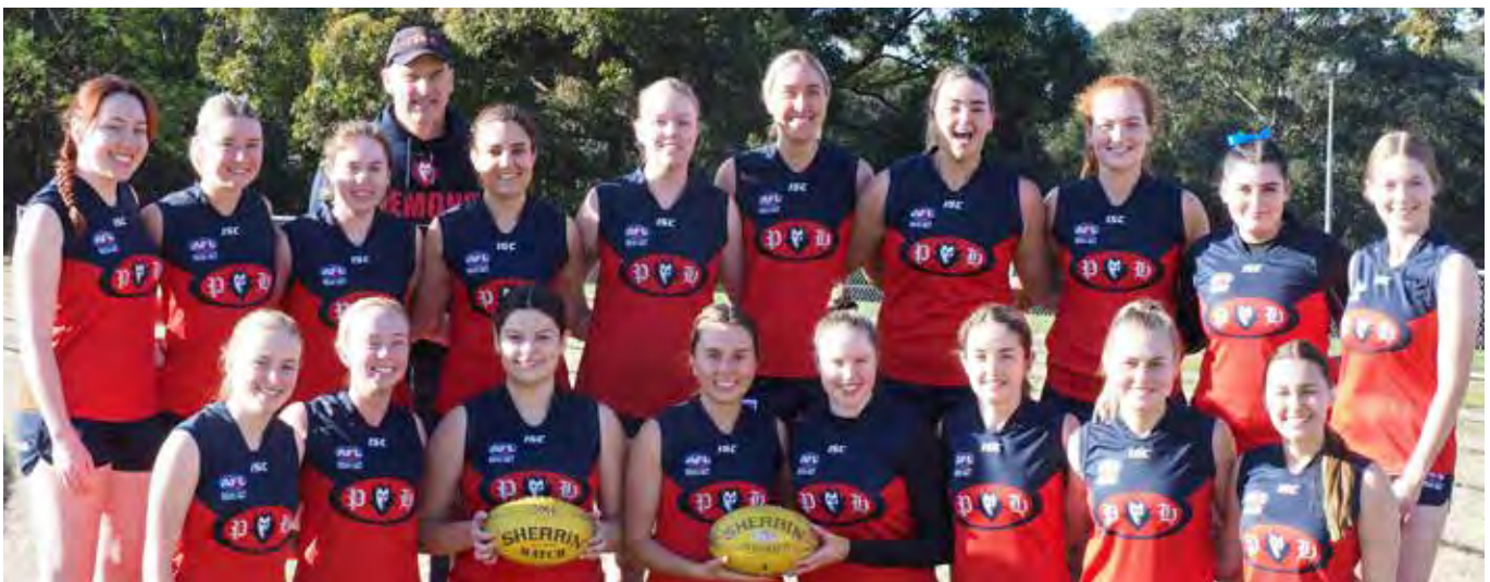
Womens Div Three 2022