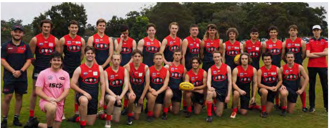
Under 19 Div One 2022