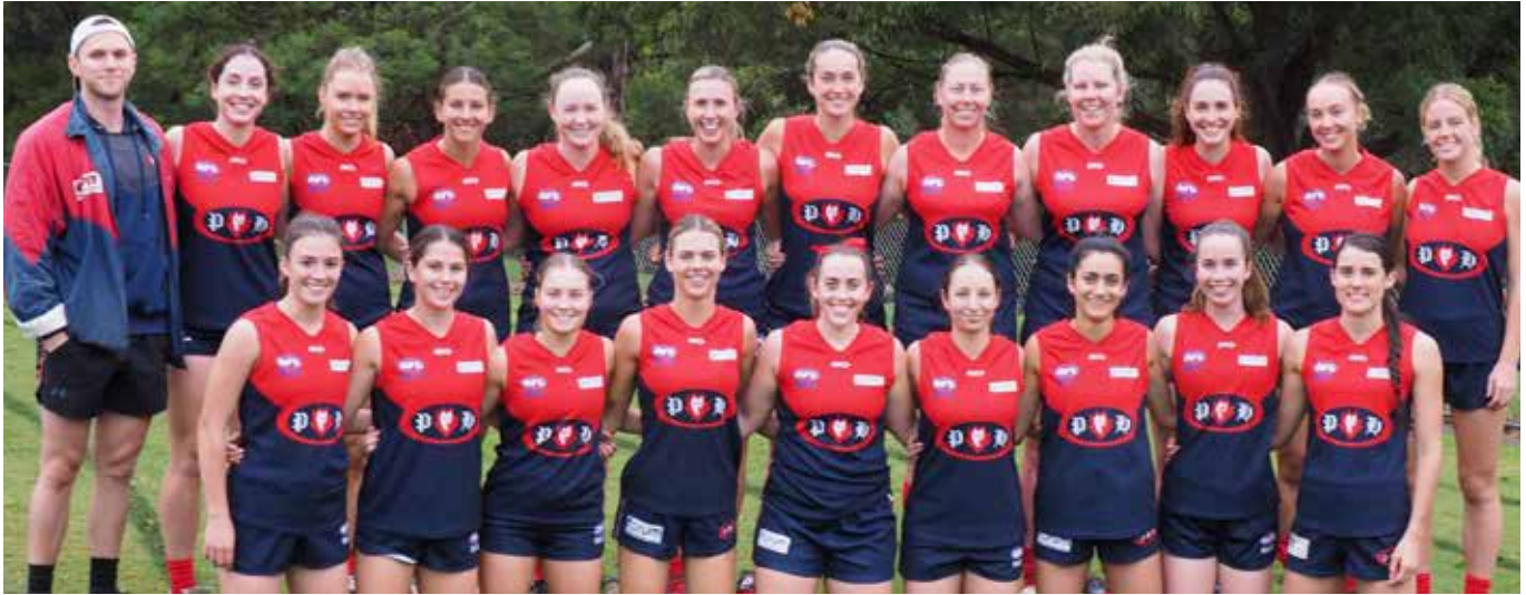
Womens Premier Div 2022