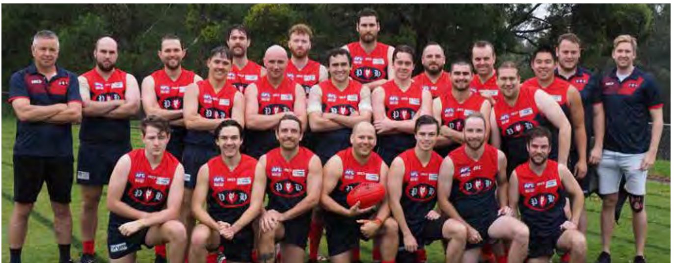
Mens Div Three 2022