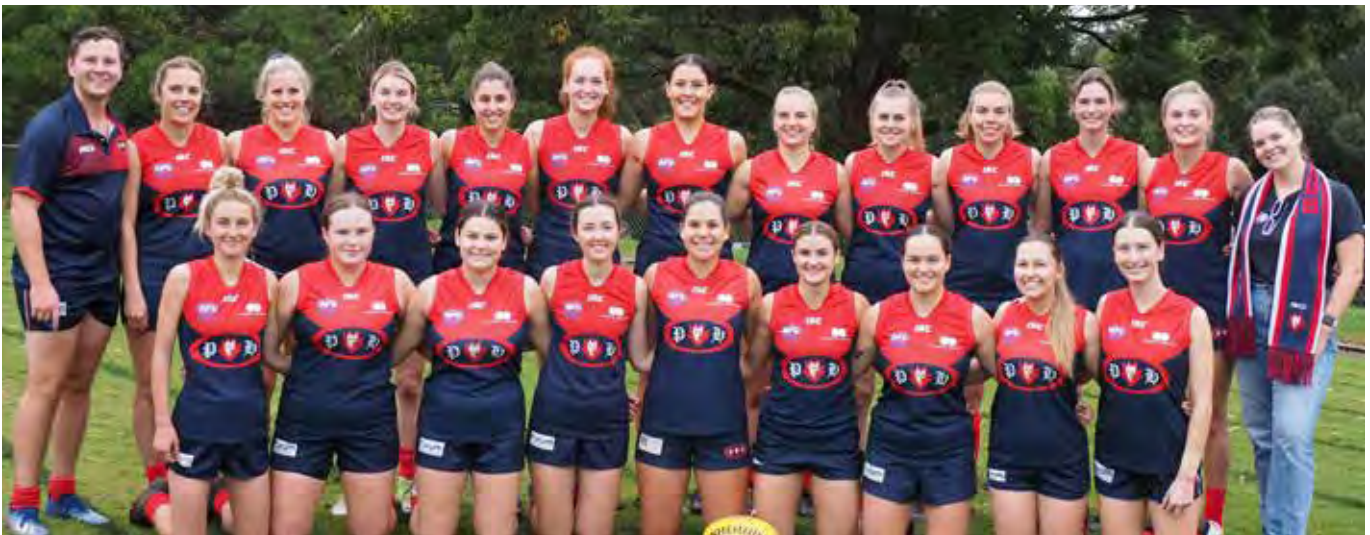
Womens Div Two 2022