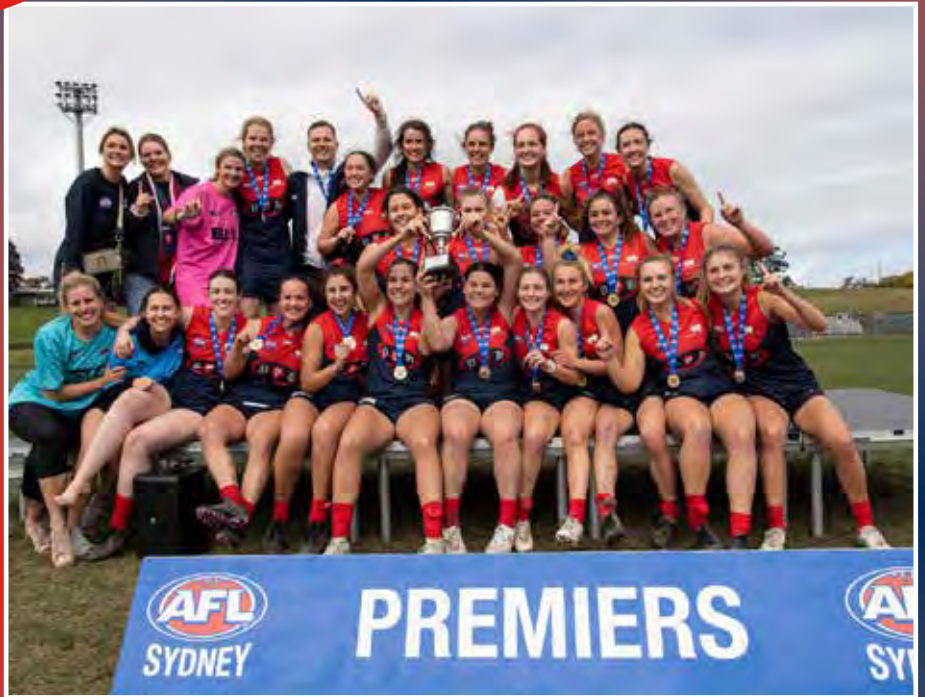
Womens Division 2 - Grand Final Winners